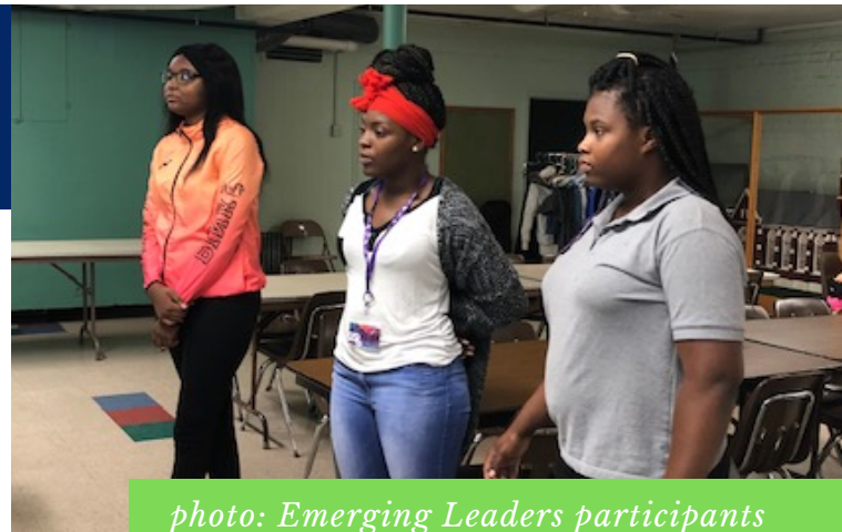
photo: Emerging Leaders participants

SLACO successfully completed 9 Engagement Circles, 4 Civic Study opportunities, 4 Community Presentations, 1 Community Event and 1 final meeting. 8 youth participated in the Emerging Leaders Institute.